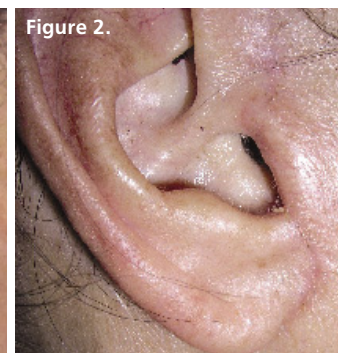
Above: Figure 1. Post Treatment. Figure 2. Full Repair.

through dermal enzyme treatments which trigger cell differentiation followed by the keratinization process. Each Danné home care prescriptive is designed for a specific purpose to take care of a specific dermal process, yet all work together to create a synergistic result.